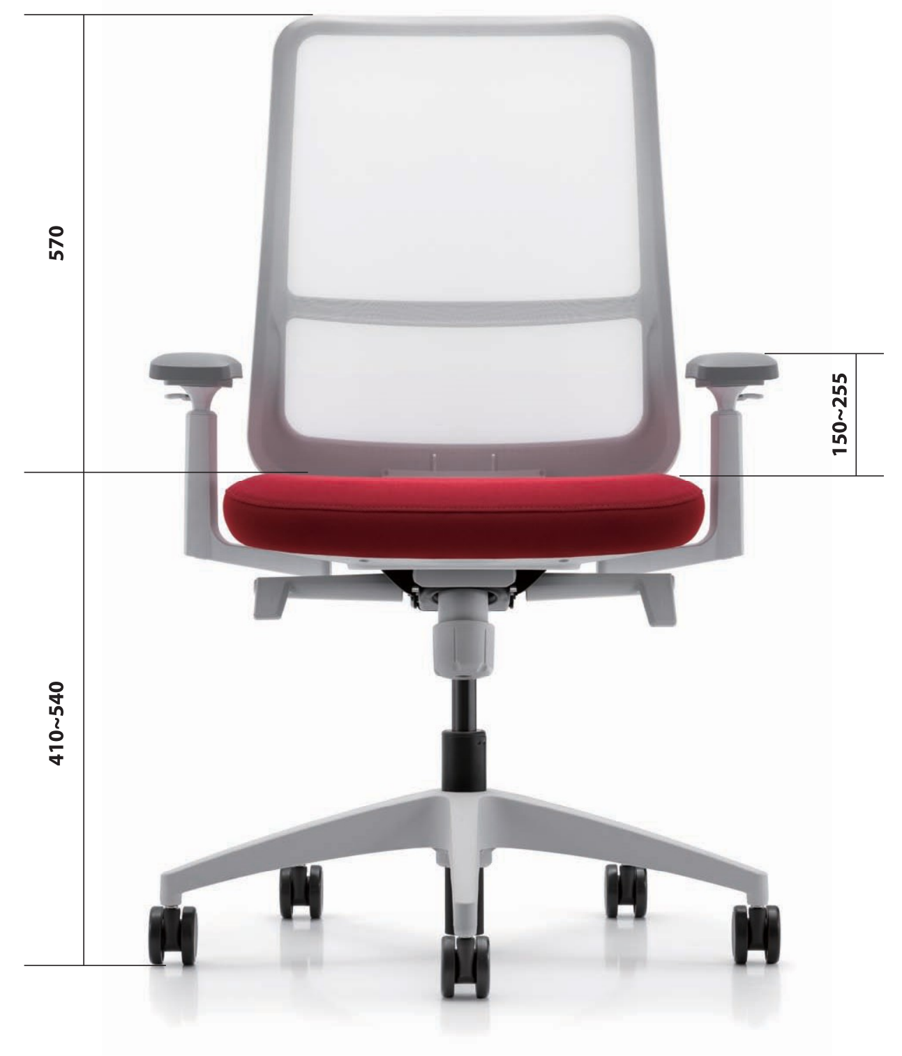
*There is a slight error in the measurement size due to the different personnel and methods.

We try to study the key dimensions of office chairs to fit ergonomics for the compliance and convenience. For shorter users, we designed the shortest seat height and lower handrail height. For tall users, we designed a higher back frame, give user good back wrapping and support, and we use high specification cylinder rods, as well as a wide range of lifting armrest for support.